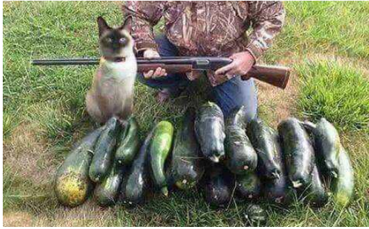
opening day of zucchini season