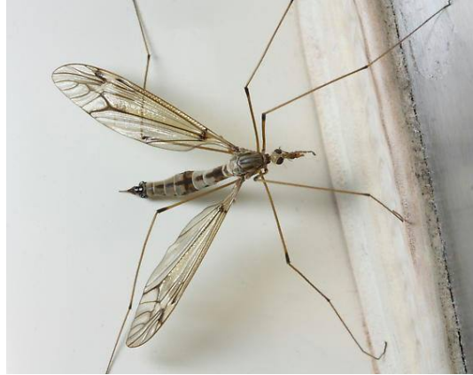
NOT a giant mosquito It is a crane fly - Learn MORE

GOT CHICKENS? Emptying a few cans of corn into a muffin tray, adding water & then freezing it is a very small act of kindness. On hot days, it'll mean the world to the chickens! Pecking away at an ice block to finally be rewarded with a cold corn kernel is a great way to help them keep cool.